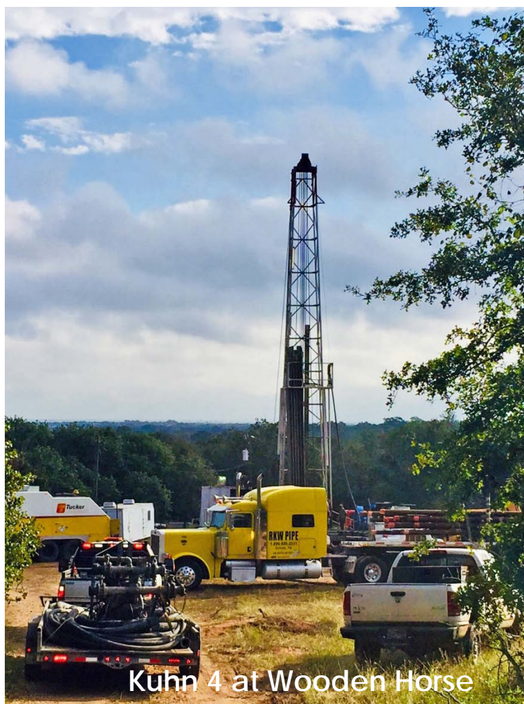
Kuhn 4 at Wooden Horse

https://www.8020connect.com/groups/emerald-bay-energy-inc